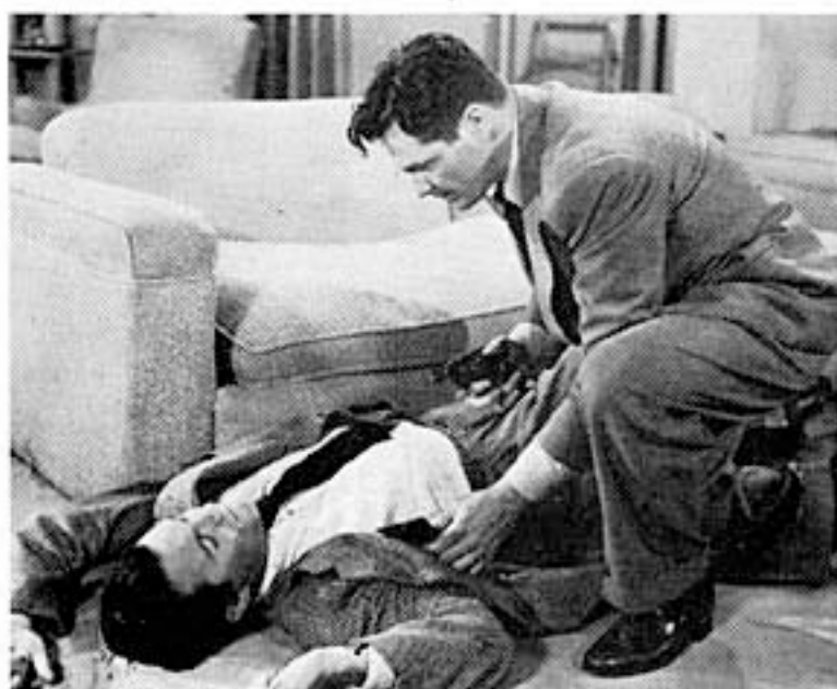
Kane Richmond finds the prostrate body of James Cardwell in a tense moment in Monogram's newest Shadow mystery, "The Missing Lady," coming to the theatre.