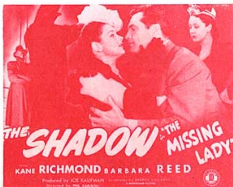
22x28 TITLE CARD AND SLIDE